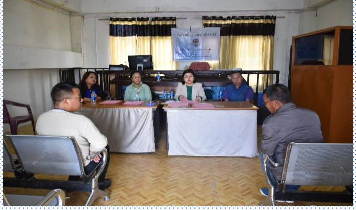
Vignette from Mizoram