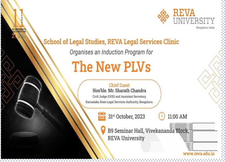
Poster of the programme organised by Karnataka SLSA