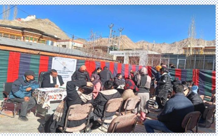
Vignette from Ladakh