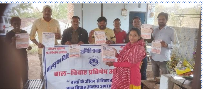
Vignettes from the programme organised by DLSAs in Rajasthan

To counter the regressive social practise of solemnizing child marriages on the occasion of DevUthani Ekadashi. Rajasthan SLSA directed all DLSAs to organize Legal Literacy and Awareness Camps, focusing on ill effects of Child Marriage and its legal implications on daily basis from 01.11.2023 to 23.11.2023. After identifying the child-marriage prone areas, frequent programmes were organized in such areas, wherein services of Panel Lawyers, PLVs, Social Workers etc. were taken to spread awareness amongst the masses about the serious consequences of child marriage; the deterrent provisions of the Prohibition of Child Marriage Act, 2006 etc.