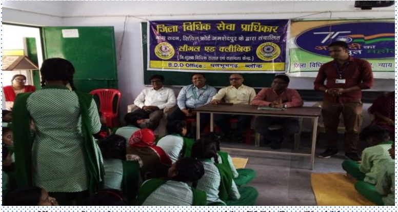
Vignette from the programme organised by DLSA, East Singhbhum, Jharkhand

On 26.10.2023, DLSA, East Singhbhum, Jharkhand, organised an Awareness Campaign at the Government High School, Narsingarh, Dhalbhumgarh, East Singhbhum, Jharkhand, on the topics: 'POCSO Act', 'Right to Education', 'Child Marriage' etc. A Legal Aid Counsel and Para Legal Volunteers addressed the students and teachers and responded to their queries. Around 147 persons participated in the programme.