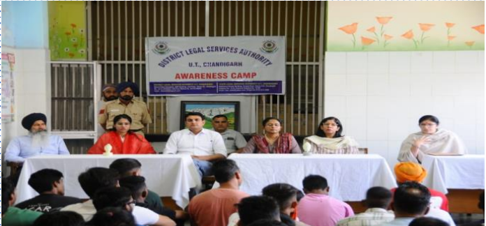
Vignettes from the programme organised by DLSA Chandigarh

On 21.10.2023, DLSA, Thiruvananthapuram, Kerala organised a program at Central Prison and Correction Home, Thiruvananthapuram for the Jail Inmates under the UTRC campaign- 2023. The inmates were extensively counselled and told about the legal provisions for grant of bail, compounding, plea bargaining and remission. The program was inaugurated by the Ld. Member Secretary, Kerala SLSA. The Secretary, DLSA, Thiruvananthapuram alongwith senior Jail Officials were also present.