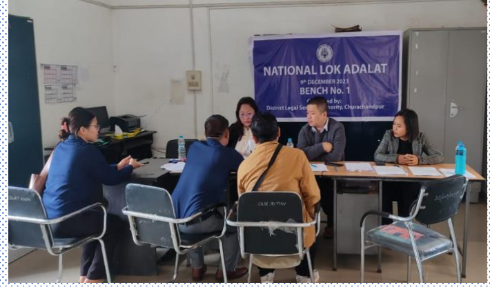
Vignette from Manipur