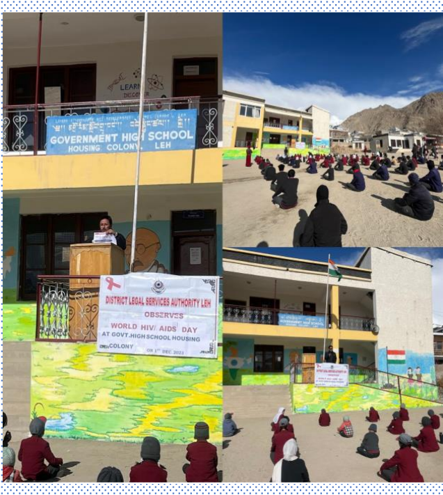
Vignettes from the programme organised by DLSA, Leh

On the occasion of World AIDS Day on 01.12.2023, the District Legal Services Authority, Leh, in collaboration with the J&K State AIDS Control Society (SACS), organised a program at Government High School Housing Colony, Leh, to spread awareness about the pivotal role communities play in combating HIV/AIDS and highlighting the legal framework outlined in the AIDS (Prevention & Control) Act 2017, particularly advocating for the rights of HIV-affected persons. An Assistant Legal Aid Defence Counsel was the Speaker for the day, who highlighted the role of DLSAs in reaching out to the He emphasized common masses. upon importance of Para Legal Volunteers as frontline workers for amplifying the message. His words echoed the importance of community-led initiatives in eradicating stigma and discrimination. program was attended by Teachers, Students and PLVs.