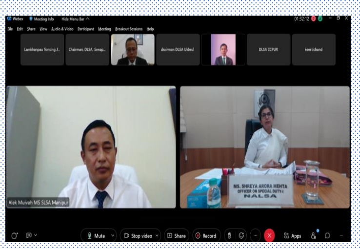
Vignette from the online training programme organised by NALSA along with Manipur SLSA