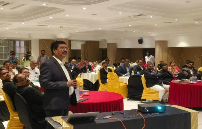
Vignettes from the programme organised by Andhra Pradesh SLSA