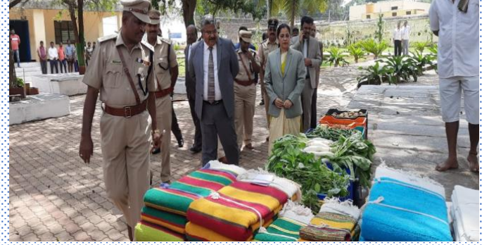
Vignettes from the programme organised by Karnataka SLSA (above)